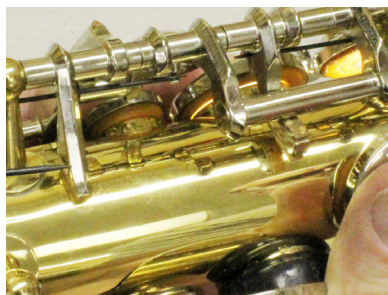
Over-adjusted LH B.