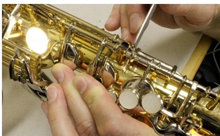
Holding A-Key and flexing foot from C back bar, with step end turned up.