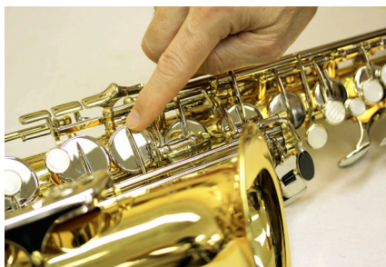
Secondary RH F#.