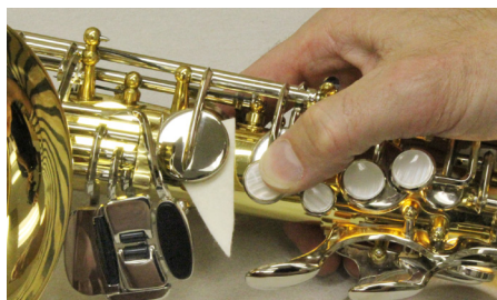
Adjusting pearl arm down and pad cup up.