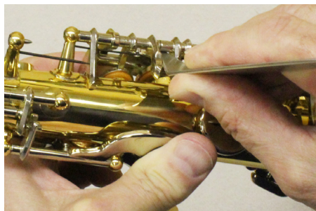
Reducing angle of C-Key arm.

Touch pieces can be aligned using a post as a fulcrum.