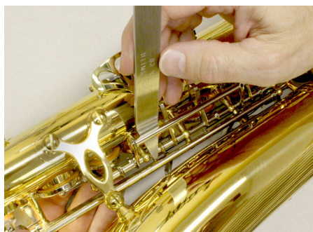
Lifting back bar of F#.