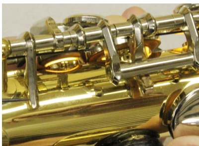
Under-adjusted LH B.