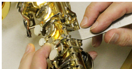
Holding B-Key and flexing back bar.

For example, if the C is under-adjusted from either the B or A, we'll work only on the C. We'll use the