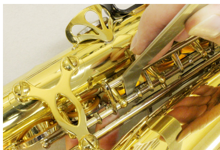
Adjusting back bar down.